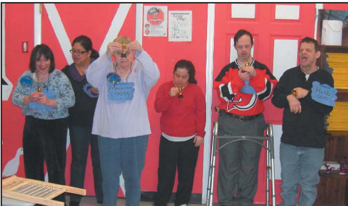
Pictured at left: Trophy Ceremony at Crossroads Olympics

This event would never have happened if the Crossroads Staff had not already been a team. Every day we make a decision to work together to enrich the lives of the people we work for. As a result we all benefit.