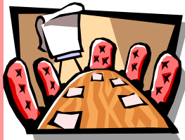
Communication is a key part of the dynamics of AHRH

The At-Home ResHab program is a Medicaid Waiver service offered at PARC. The At-Home ResHab Supervisor of this department handles all every-day aspects of this program. Once an individual has established eligibility for the program, the beginning stages of receiving services start. The first step is a face-to-face meeting between the family and At-Home ResHab Supervisor, along with your Service Coordinator. Here, all aspects of the program are explained and individual goals are created based on needs, preferences, and level of ability. Staffing options are discussed, and PARC policies are shared with the family to insure the best qualified staffing possible. Appropriate staff assignment is vital to insuring that the individual receives the best possible service.